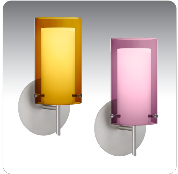
PAHU 4 SHOWN IN TRANS. ARMAGNAC/OPAL (G44007) & TRANS. AMETHYST/OPAL (A44007)

UL or ETL Listed. Suitable for Damp Locations (interior use only).