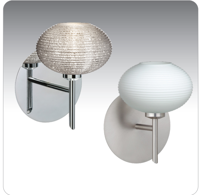
LASSO SHOWN IN GLITTER (5612GL) IN CHROME FINISH & OPAL MATTE (561207)

UL or ETL Listed. Suitable for Damp Locations (interior use only).