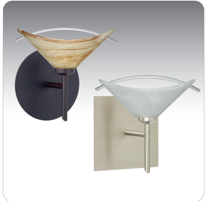
HOPPI SHOWN IN MOCHA/CLEAR (181305) WITH SQUARE CANOPY IN CHROME FINISH & MARBLE/CLEAR (181304)

UL or ETL Listed. Suitable for Damp Locations (interior use only).