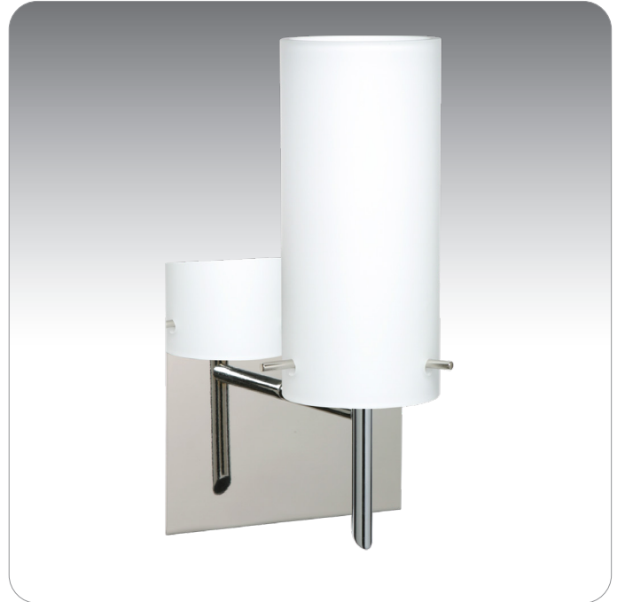
COPA 3 SHOWN IN OPAL MATTE (440307) WITH SQUARE CANOPY IN CHROME FINISH

UL or ETL Listed. Suitable for Damp Locations (interior use only).