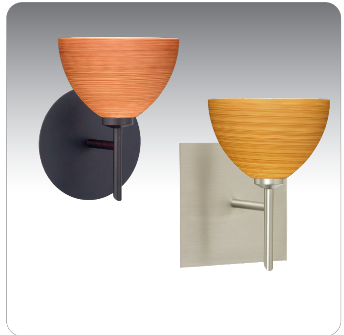
BRELLA SHOWN IN CHERRY (4679CH) IN BRONZE FINISH & OAK (4679OK) WITH SQUARE CANOPY