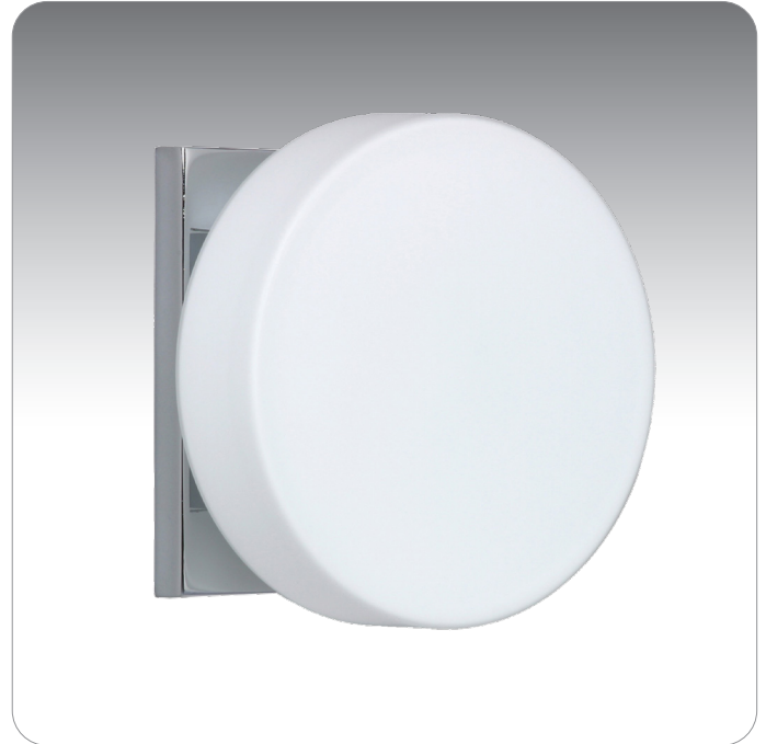
CIRO SHOWN IN OPAL MATTE (773807) IN CHROME FINISH

UL or ETL Listed. Suitable for Damp Locations (interior use only).