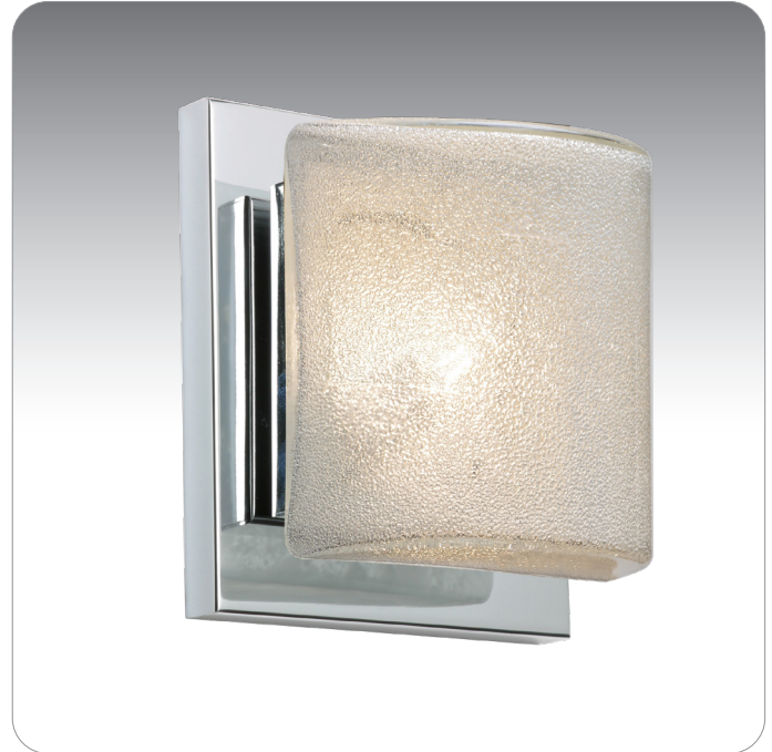
PAOLO SHOWN IN GLITTER (7873GL) IN CHROME FINISH