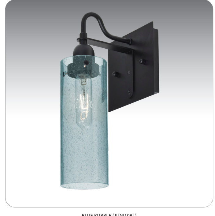
BLUE BUBBLE (JUNI10BL)