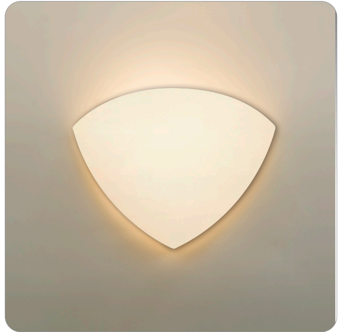
CIRRUS SHOWN IN OPAL MATTE (297107)

UL or ETL Listed. Suitable for Wet Locations (interior or exterior use).