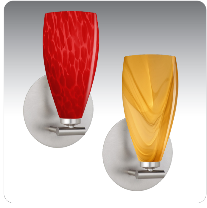
KARLI SHOWN IN RED CLOUD (7198RC) & HONEY (7198HN)