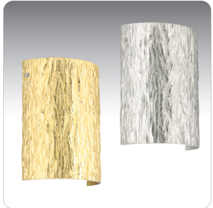
TAMBURO 8 SHOWN IN STONE GOLD FOIL (7090GF) & STONE SILVER FOIL (7090SF)

UL or ETL Listed. Suitable for Damp Locations (interior use only).