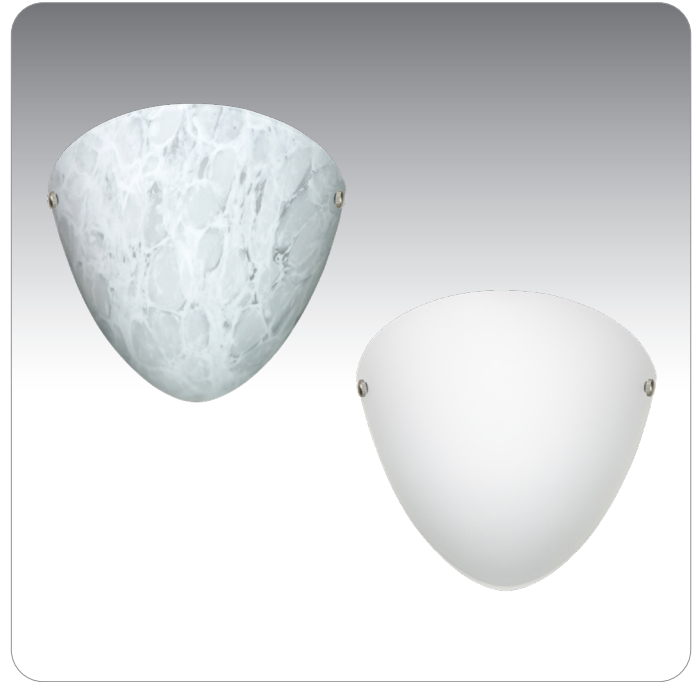
KAILEE SHOWN IN CARRERA (701719) & OPAL MATTE (701707)