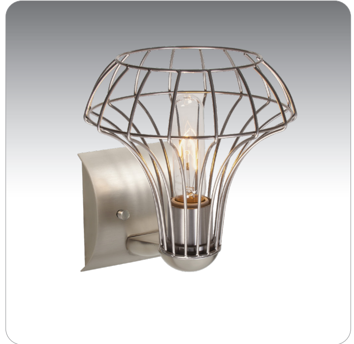
SPEZZA 7 SHOWN IN SATIN NICKEL

UL or ETL Listed. Suitable for Damp Locations (interior use only).