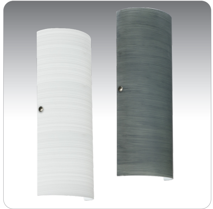
TORRE 18 SHOWN IN CHALK (8193KR) & TITAN (8193TN)

UL or ETL Listed. Suitable for Damp Locations (interior use only).