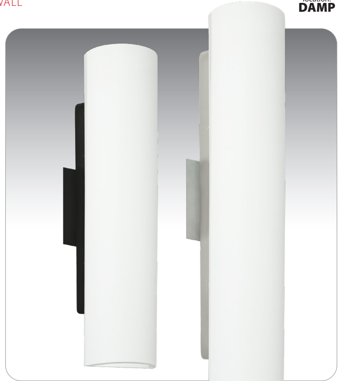
DARCI 16 SHOWN IN OPAL MATTE (272507) & DARCI 21 SHOWN IN OPAL MATTE (272607)

UL or ETL Listed. Suitable for Damp Locations (interior use only).