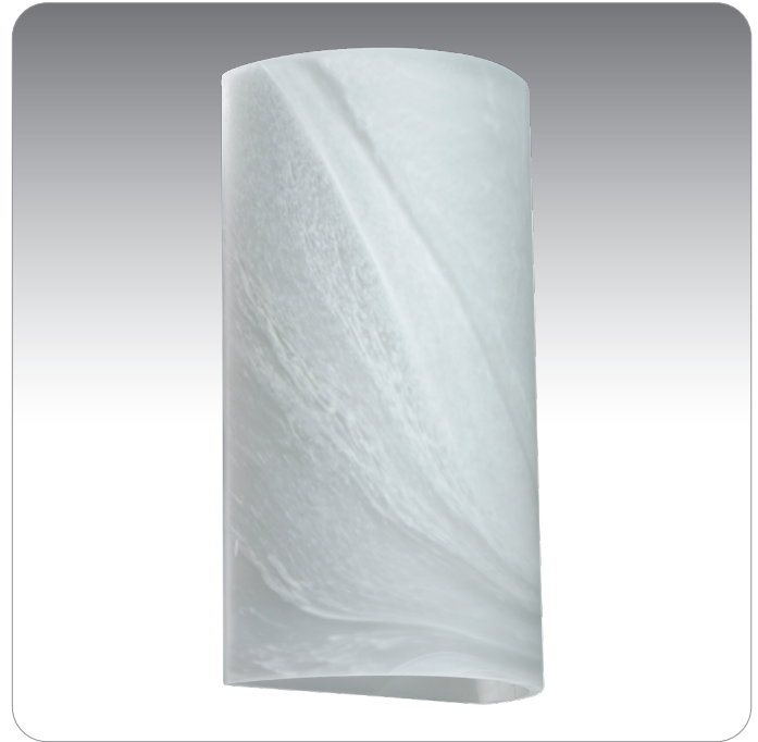
DORIAN 10 SHOWN IN MARBLE (119852)