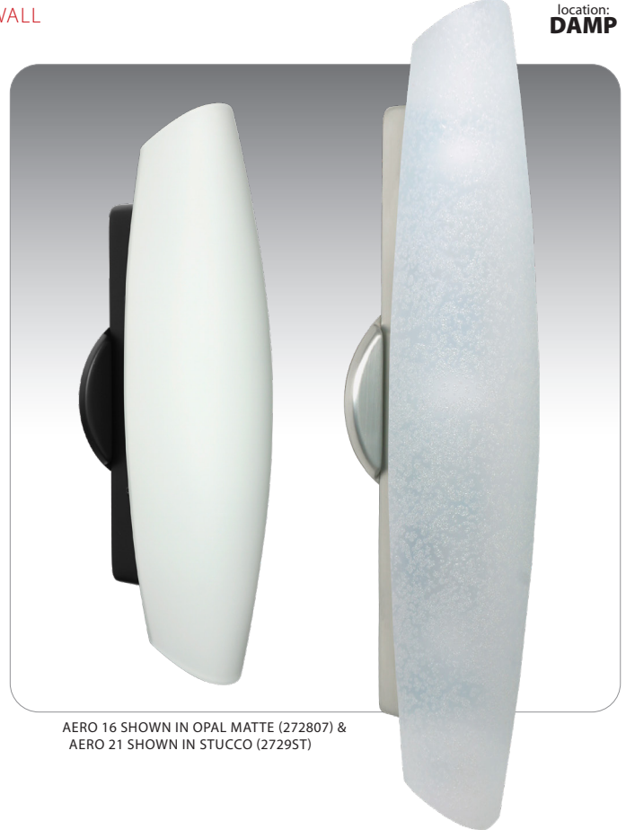
AERO 16 SHOWN IN OPAL MATTE (272807) & AERO 21 SHOWN IN STUCCO (27295T)

UL or ETL Listed. Suitable for Damp Locations (interior use only).