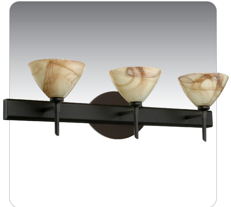
DOMI SHOWN IN MOCHA (174383) IN BRONZE FINISH

UL or ETL Listed. Suitable for Damp Locations (interior use only).