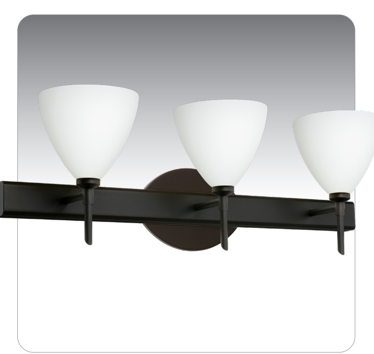
MIA SHOWN IN OPAL MATTE (177907) IN BLACK FINISH

UL or ETL Listed. Suitable for Damp Locations (interior use only).