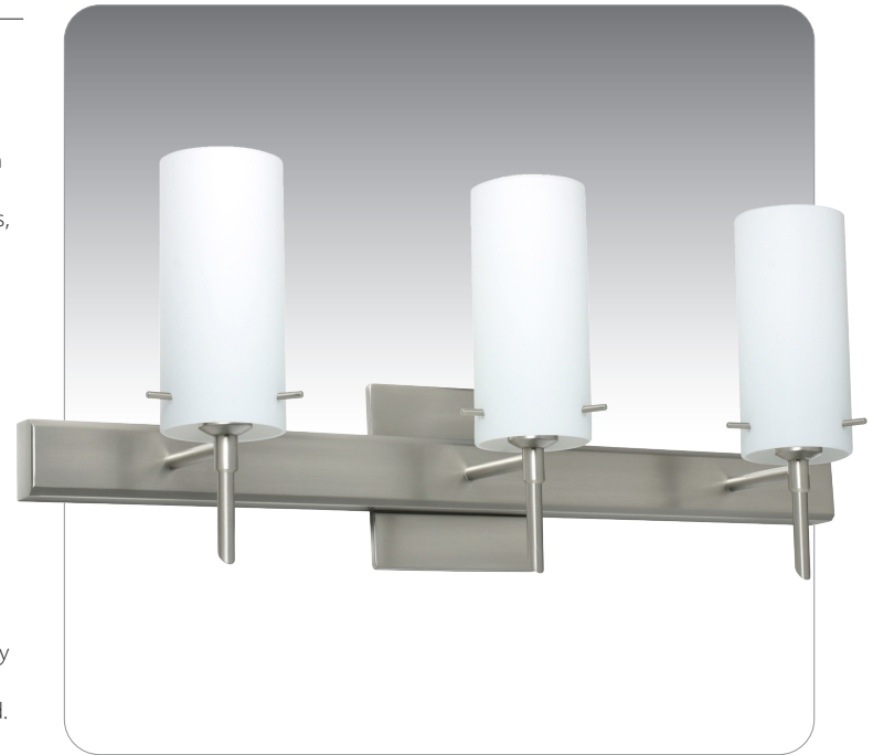
COPA 3 SHOWN IN OPAL MATTE (440307)