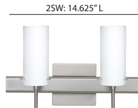
2SW: 14.625" L