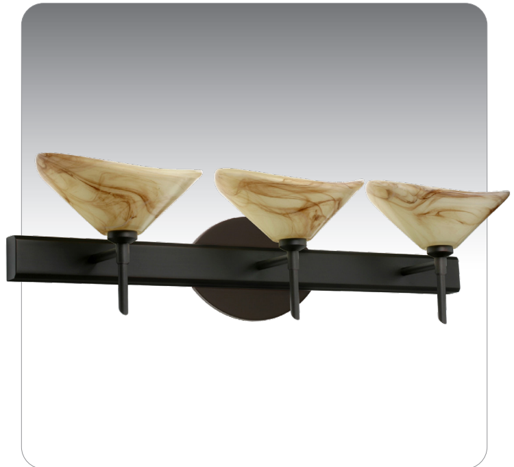
HOPPI SHOWN IN MOCHA (191383) IN BRONZE FINISH

UL or ETL Listed. Suitable for Damp Locations (interior use only).