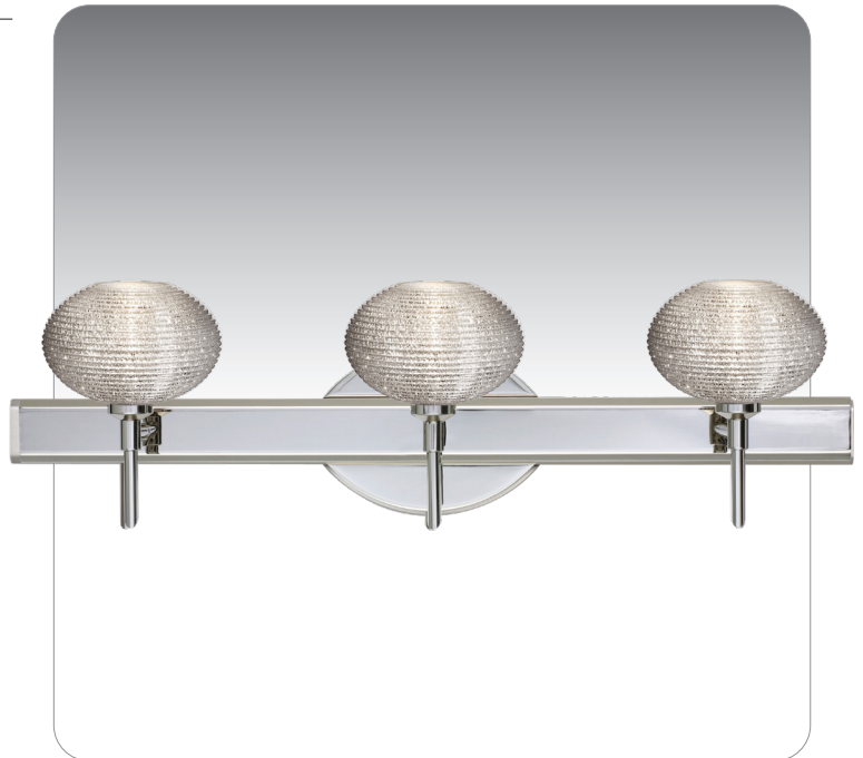
LASSO SHOWN IN GLITTER (5612GL) IN CHROME FINISH

UL or ETL Listed. Suitable for Damp Locations (interior use only).