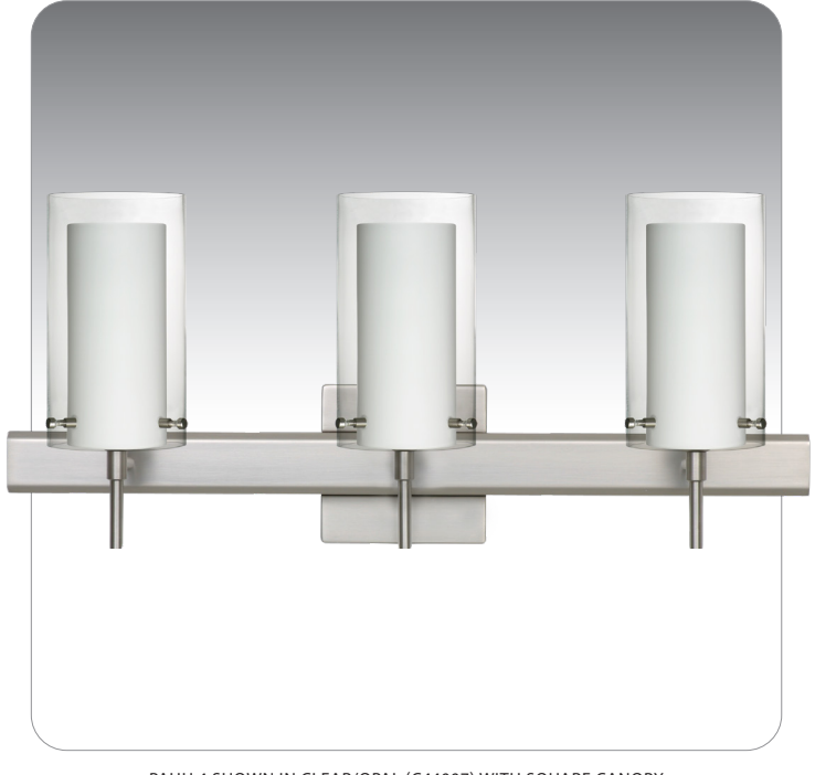
PAHU 4 SHOWN IN CLEAR/OPAL (C44007) WITH SQUARE CANOPY

UL or ETL Listed. Suitable for Damp Locations (interior use only).