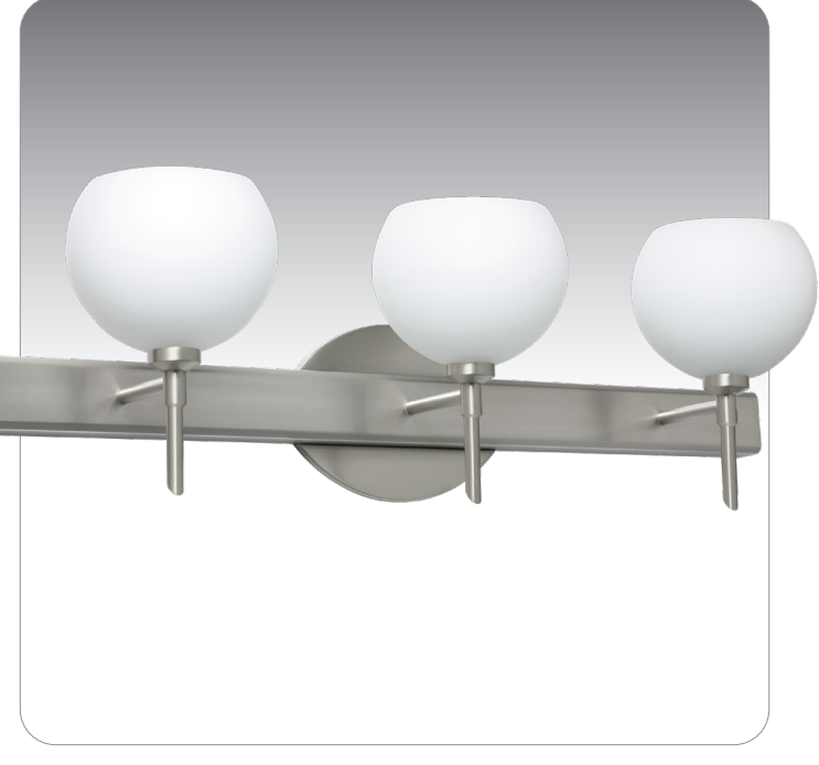
PALLA 5 SHOWN IN OPAL MATTE (565807)

UL or ETL Listed. Suitable for Damp Locations (interior use only).