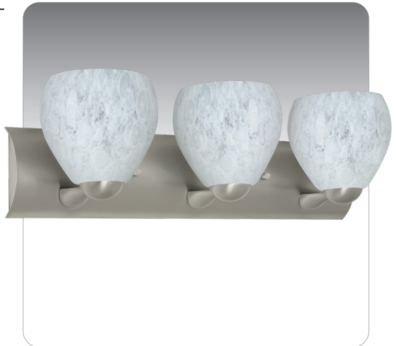
BOLLA SHOWN IN COCOON (412260)

UL or ETL Listed. Suitable for Damp Locations (interior use only).