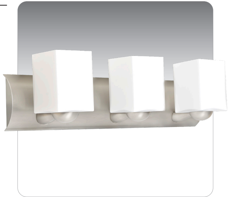
RISE SHOWN IN OPAL MATTE (449807)

UL or ETL Listed. Suitable for Damp Locations (interior use only).