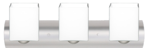
3WZ: 22.4375" L