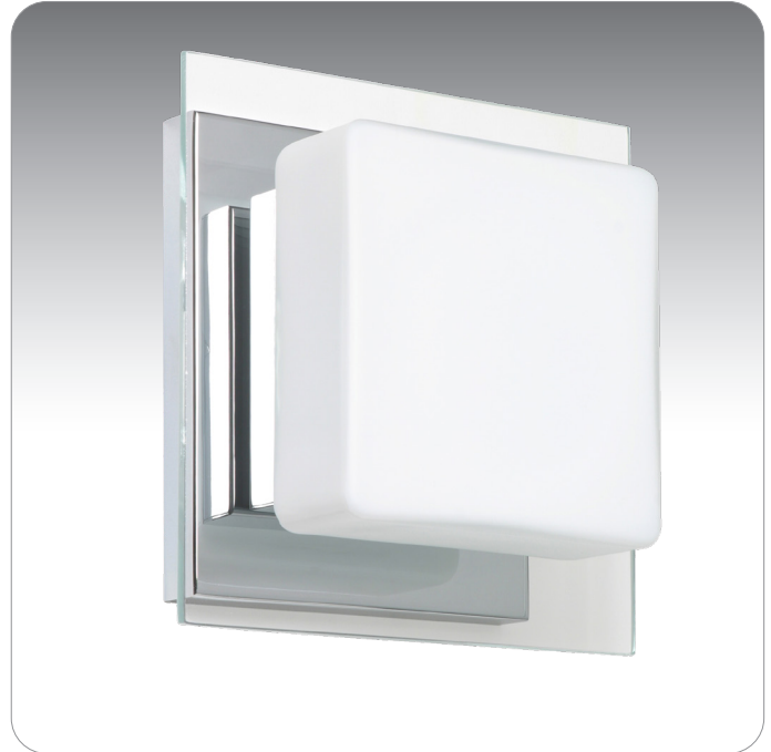
ALEX SHOWN IN OPAL/CLEAR (773539)

UL or ETL Listed. Suitable for Damp Locations (interior use only).