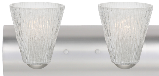
NICO5GL GLITTER STONE