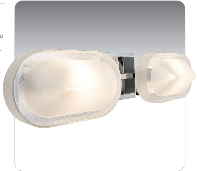
CABO SHOWN IN FROST/BUBBLE (962759)

UL or ETL Listed. Suitable for Damp Locations (interior use only).