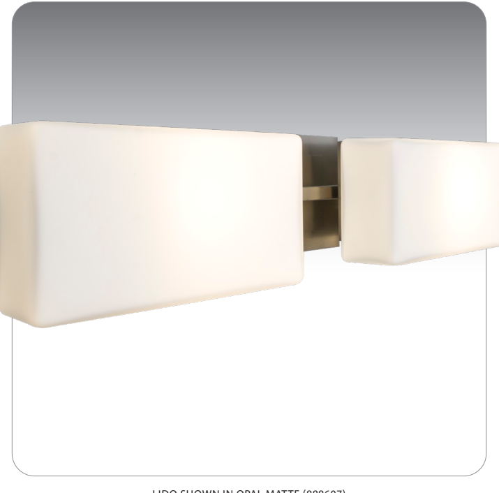
LIDO SHOWN IN OPAL MATTE (888607)