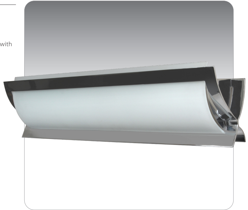
ELANA 26 SHOWN IN SATIN WHITE (ELANA26-SW)

UL or ETL Listed. Suitable for Damp Locations (interior use only).