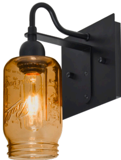
MILO4WF WHITE FROST