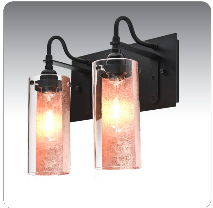
COPPER FOIL (DUKECF)

UL or ETL Listed. Suitable for Damp Locations (interior use only).