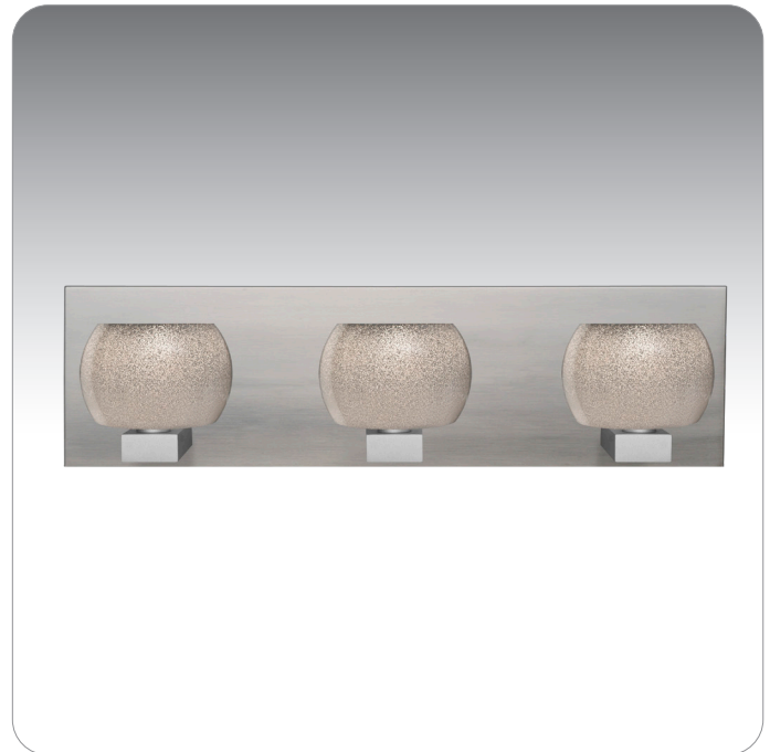
SMOKE SAND (KENOSM)

UL or ETL Listed. Suitable for Damp Locations (interior use only).