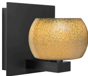
KENOWH WHITE SAND