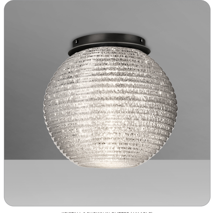
KRISTALL 8 SHOWN IN GLITTER (4616GLC)