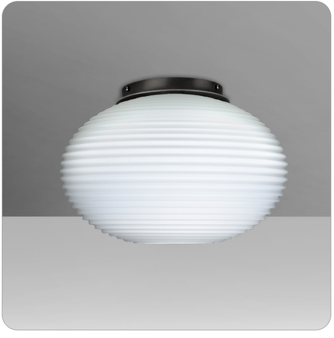
PAPE 10 SHOWN IN OPAL MATTE (491207C)