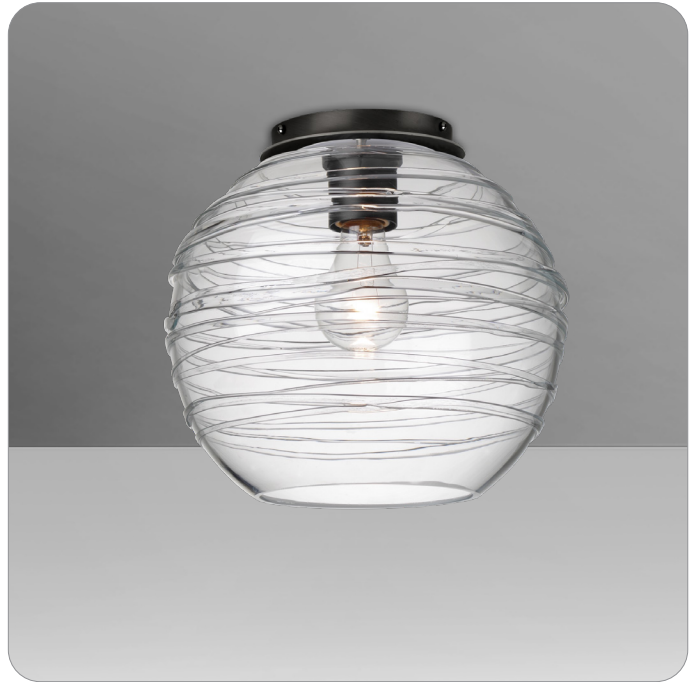
WAVE 10 CEILING SHOWN IN CLEAR (462761C)

UL or ETL Listed. Suitable for Damp Locations (interior use only).