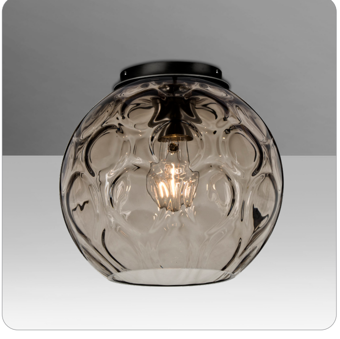
BOMBAY CEILING SHOWN IN SMOKE (BOMBAYSMC)