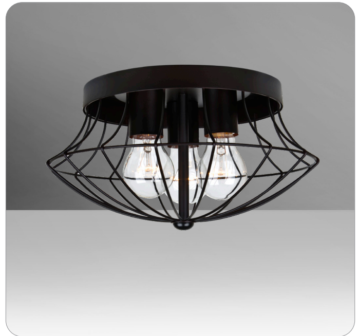
SPEZZA 13 CEILING SHOWN IN BLACK (SPEZZA13C-BK)

UL or ETL Listed. Suitable for Damp Locations (interior use only).