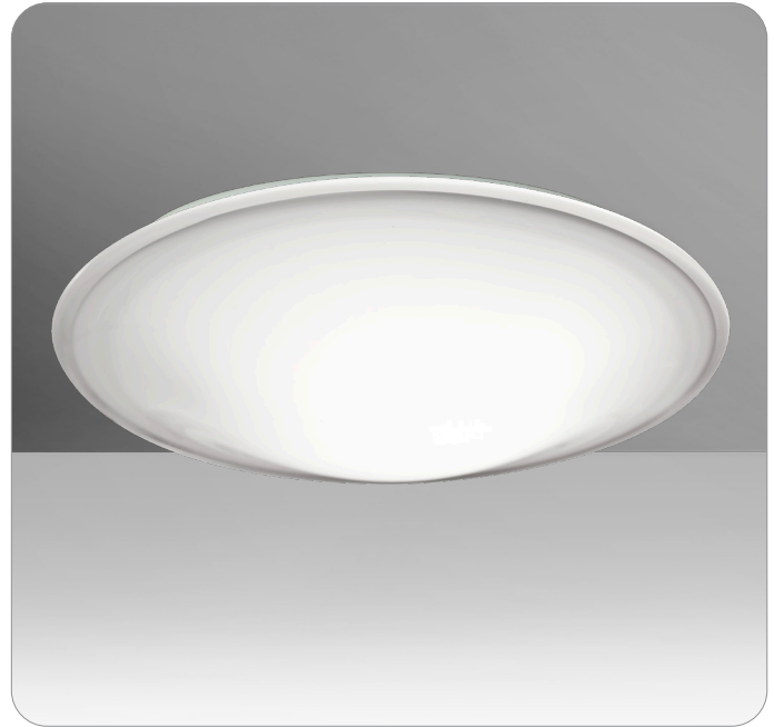
LUMA CEILING SHOWN IN OPAL GLOSSY/CLEAR

UL or ETL Listed. Suitable for Damp Locations (interior use only).