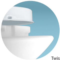
Twist and lock bayonet glass