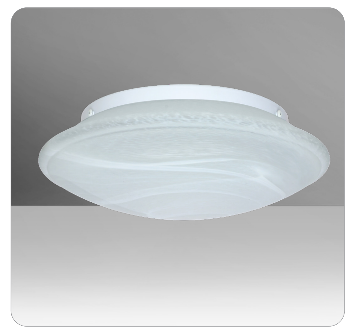
SOLA CEILING SHOWN IN MARBLE

UL or ETL Listed. Suitable for Damp Locations (interior use only).