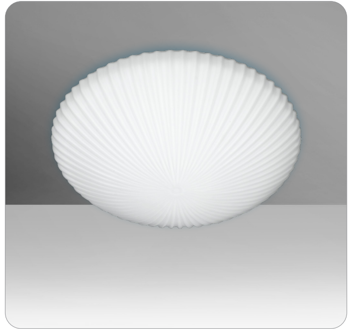
KATIE CEILING SHOWN IN OPAL MATTE

UL or ETL Listed. Suitable for Damp Locations (interior use only).