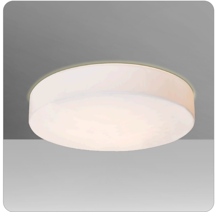
OPAL MATTE (PRIDE1407C)

UL or ETL Listed. Suitable for Damp Locations (interior use only).