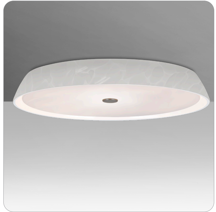
SOPHI SHOWN IN WHITE CLOUD

UL or ETL Listed. Suitable for Damp Locations (interior use only).