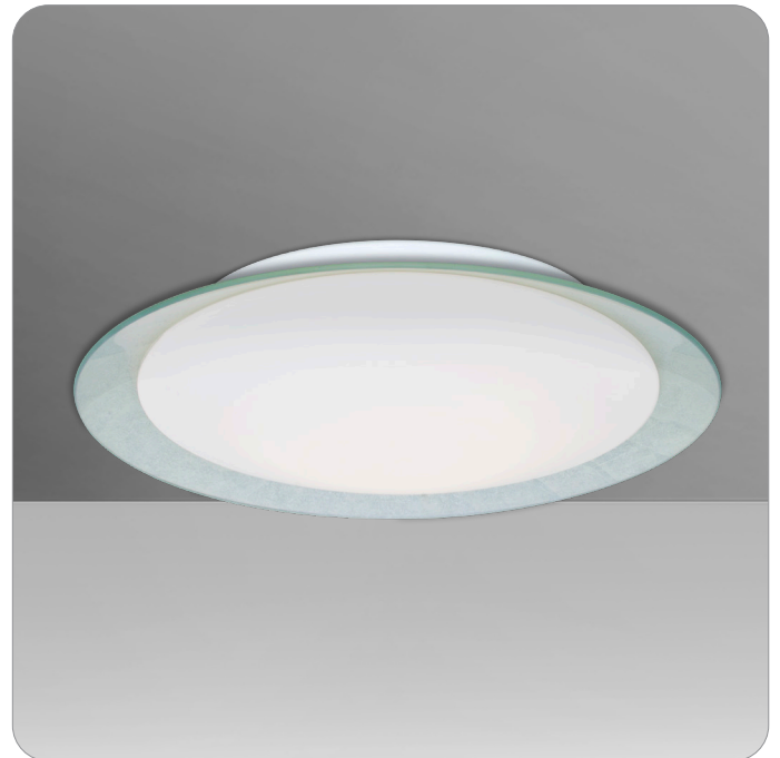
OPAL/SILVER FOIL (TUCA19SFC)

UL or ETL Listed. Suitable for Damp Locations (interior use only).