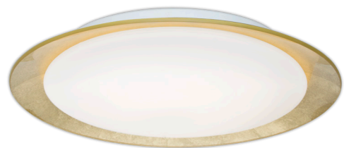
TUCA15GFC OPAL/GOLD FOIL