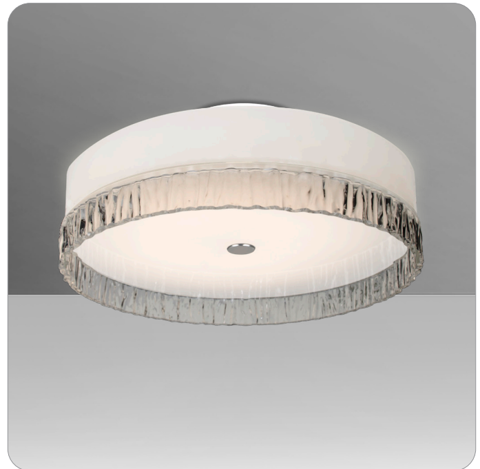
OPAL/SMOKE STONE (PACO19SMC)

UL or ETL Listed. Suitable for Damp Locations (interior use only).