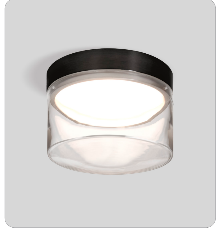
CLEAR WITH BLACK CAP