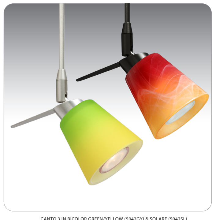
CANTO 3 IN BICOLOR GREEN/YELLOW (5042GY) & SOLARE (5042SL)