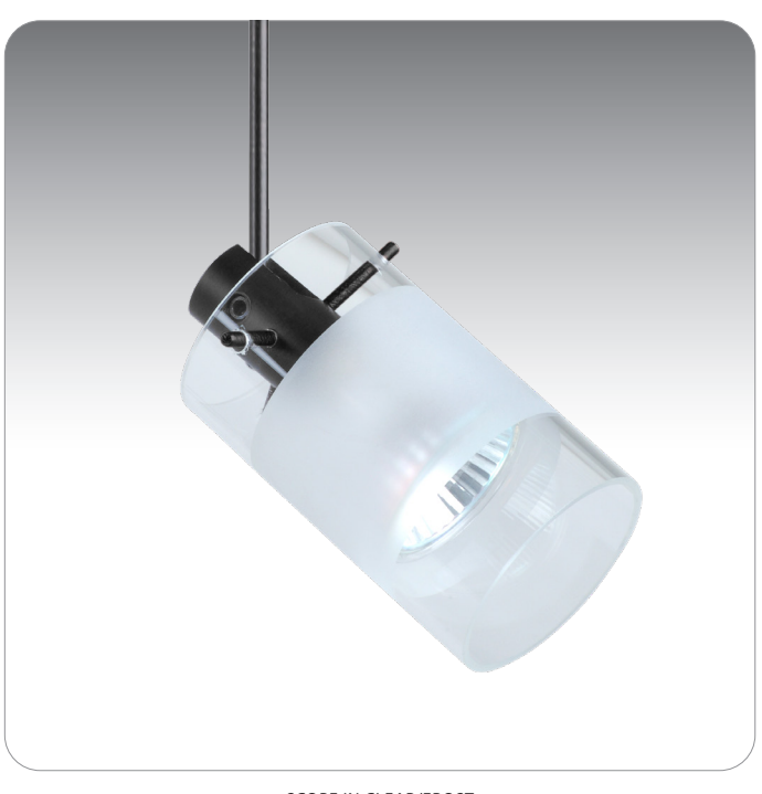
SCOPE IN CLEAR/FROST