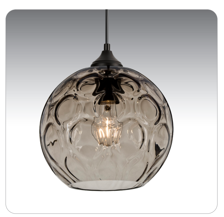
BOMBAY SHOWN IN SMOKE (BOMYSM)

UL or ETL Listed. Suitable for Damp Locations (exterior use under covered ceiling only).